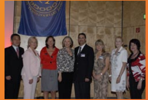
The old and new board members.