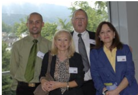
Great Britain delegates.