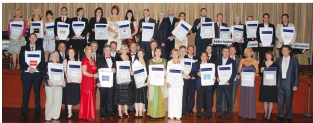
All Sponsors acknowledged at Gala Dinner for their great contribution to the 57th CIDESCO World Congress and Exhibition in Baden-Baden, Germany 2008.

From 12th – 14th September 2009 the 58th CIDESCO World Congress and Exhibition is to be held in Kyoto, Japan. We look forward to seeing you all there.