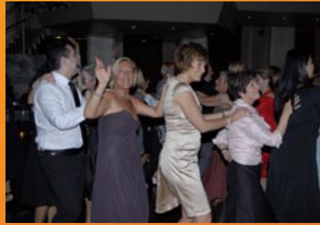
The famous CIDESCO conga line.