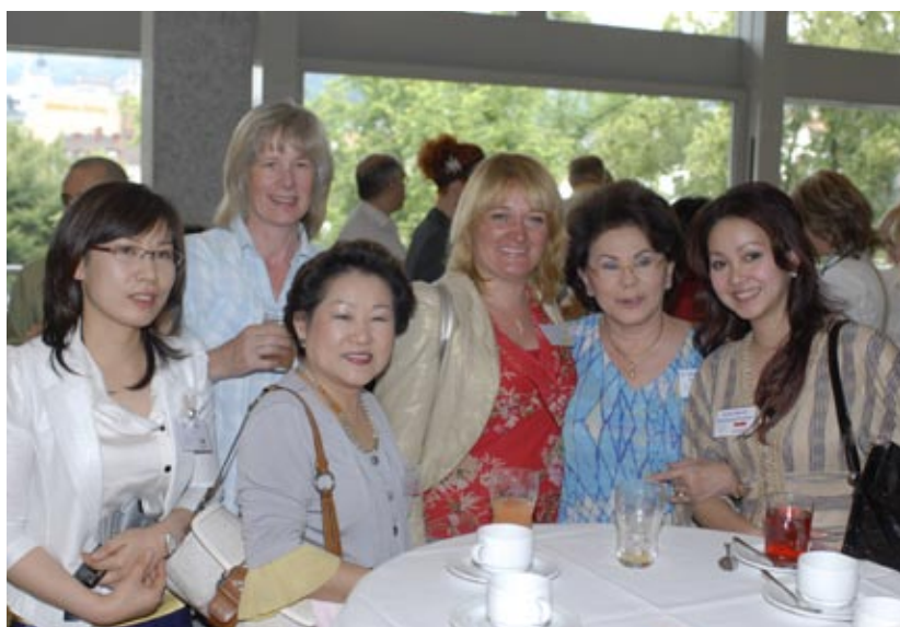
Korean, Irish and Indonesian school delegates.