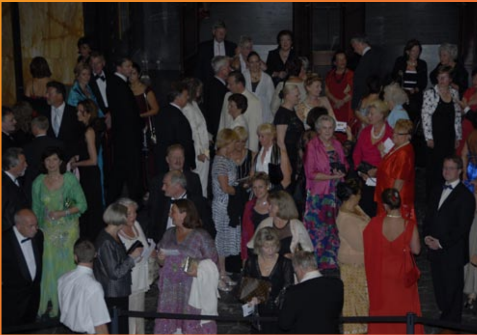
Gala dinner crowd.