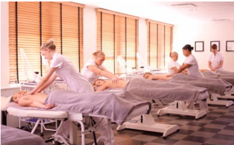
Privatskolan för Hudvård & Spa, Sweden.