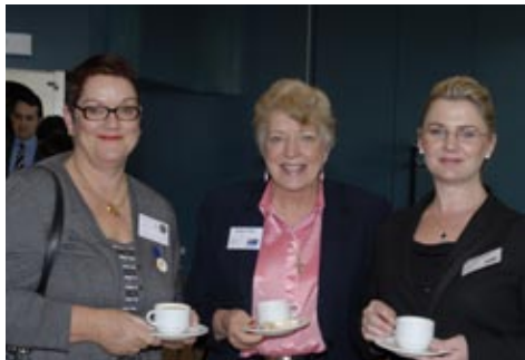
Australian school delegates.