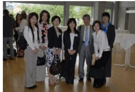
Japanese school delegates.