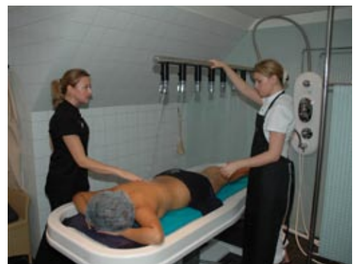
Privatskolan för Hudvård & Spa, Sweden.