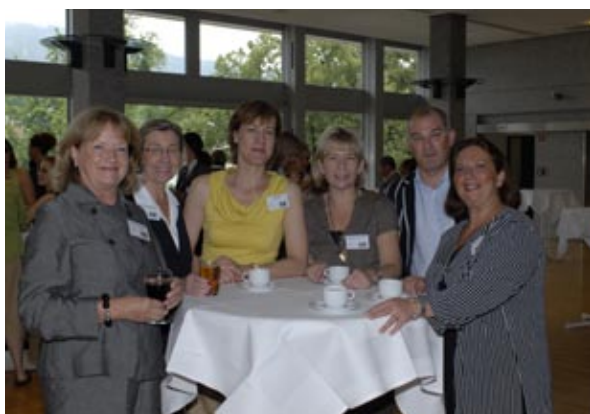
Swedish school delegates.