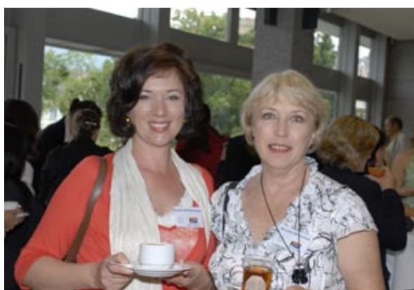
South African school delegates.