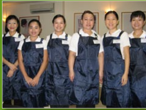
Top to Toe School of Beauty Therapy, First CIDESCO SPA exams in Singapore