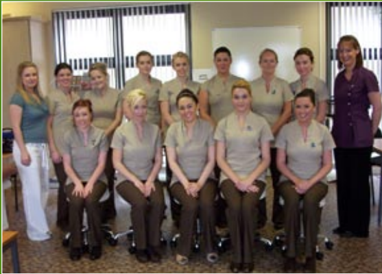
Successful CIDESCO candidates together with their Principal and Tutor at Younique College of Beauty & Holistics, Newry, Nth Ireland